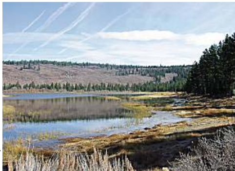
Dry Creek at Waddle Ranch in Martis Valley

Don't miss the 19th annual Chocolate Festival Saturday November 3rd at the North Lake Tahoe Conference Center in Kings Beach. Proceeds benefit Tahoe